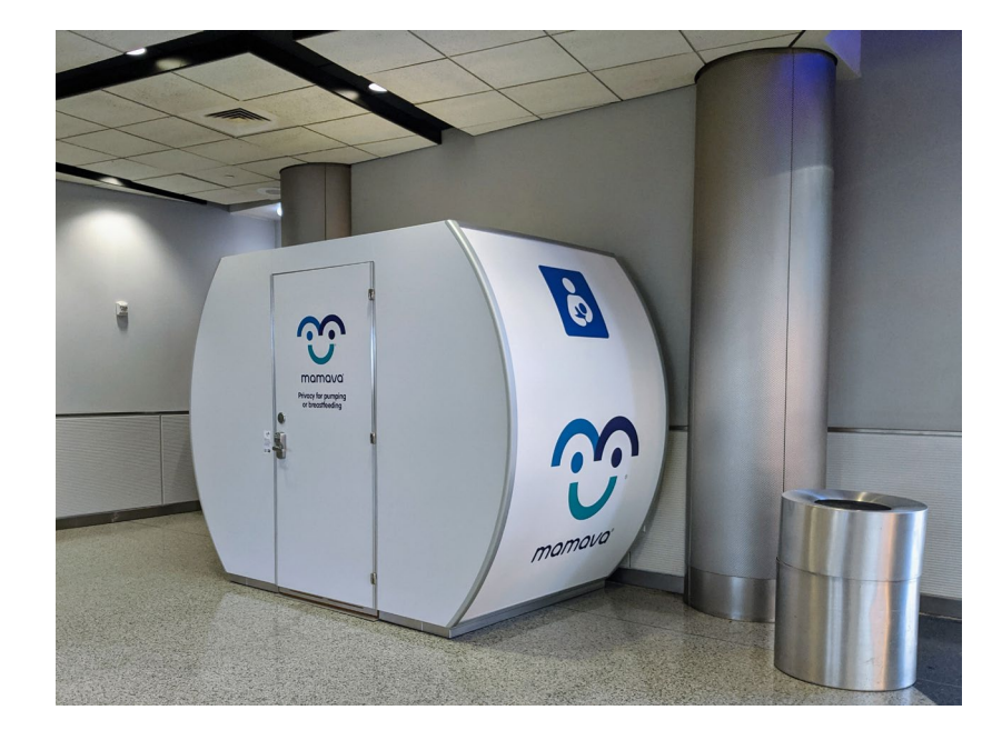
The image is bright and well lit.