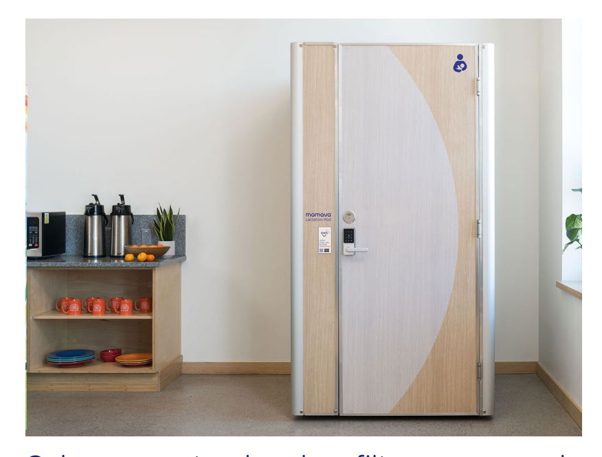
Colors are natural and no filters were used.