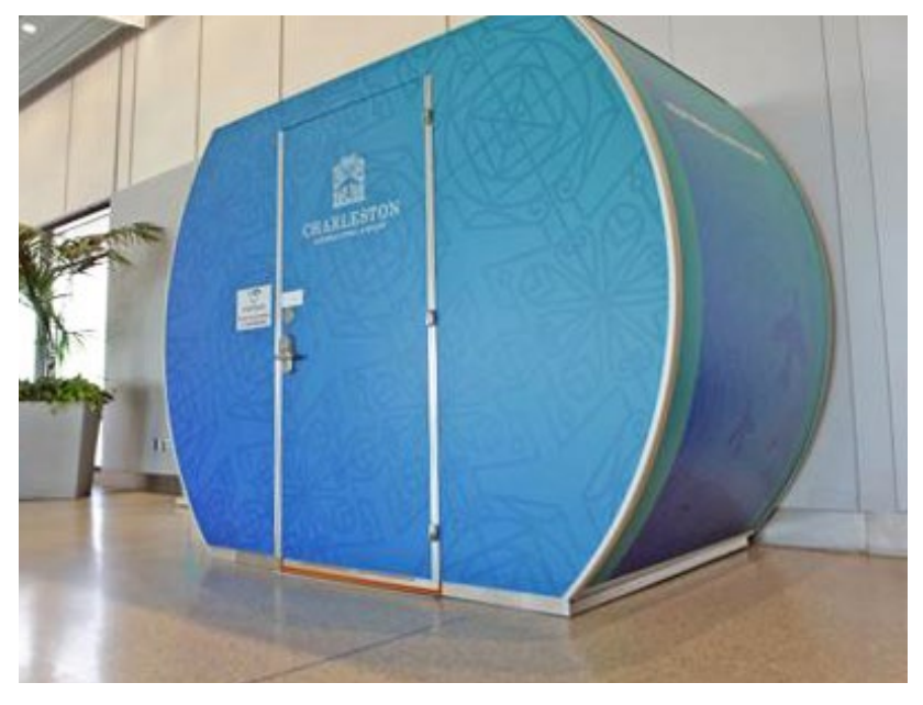
A proud pod!