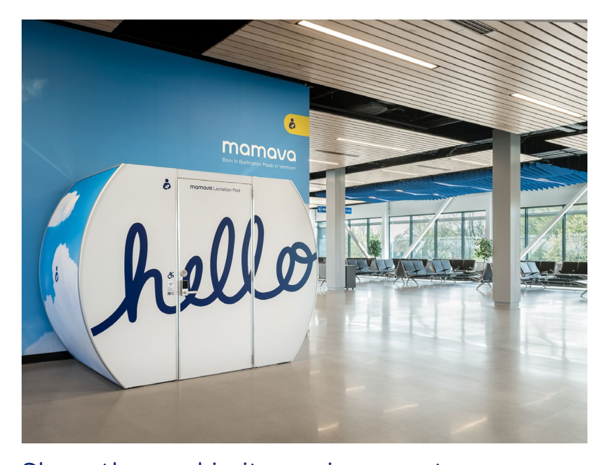
Show the pod in its environment.