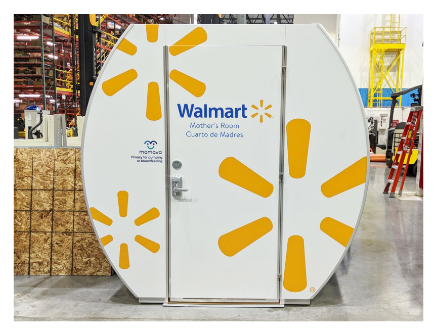
The pod is symmetrical.