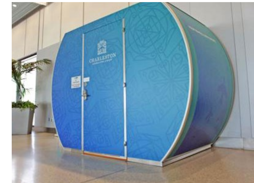
A proud pod!