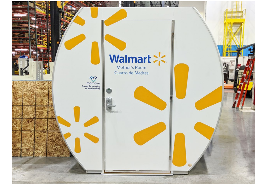
The pod is symmetrical.