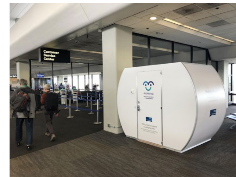
Show the pod in its environment.