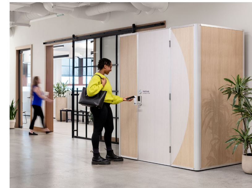
Show a parent walking into/accessing a pod.