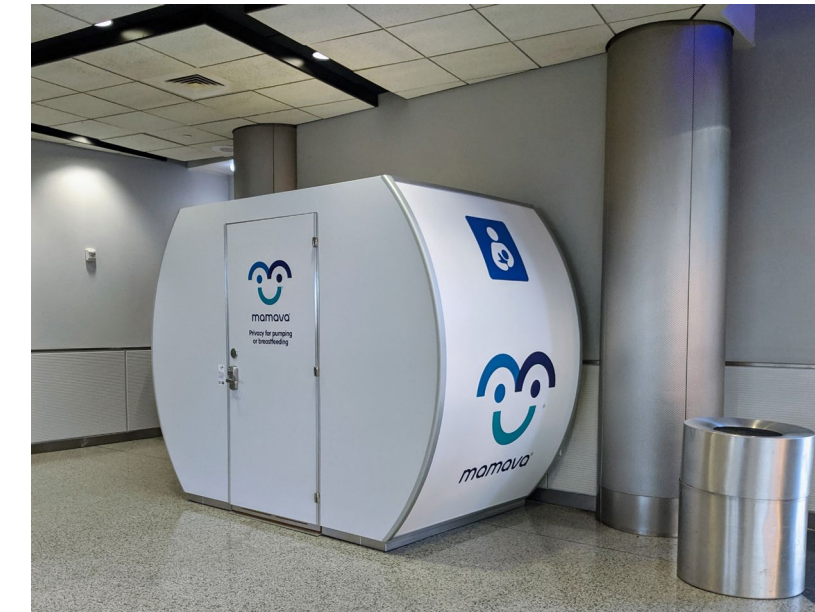
The image is bright and well lit.

Here are some of our favorite shots of our products in the field: