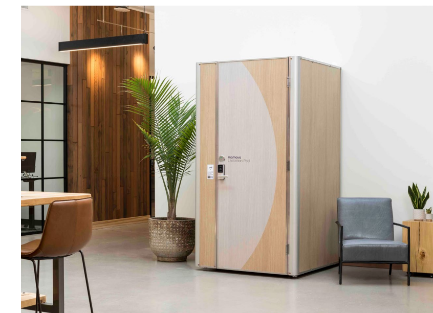
Colors are natural and no filters were used.